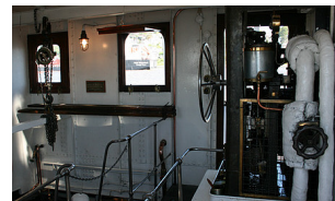
The UV system is installed in the mechanical room of your boat